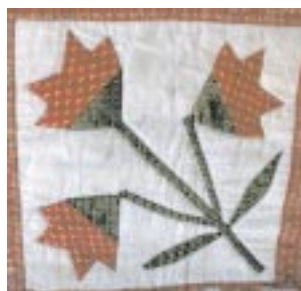
A square from the Delaware Valley quilt at left, 1840's