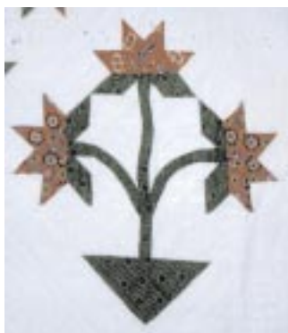
Carolina Lily quilt, 1860's