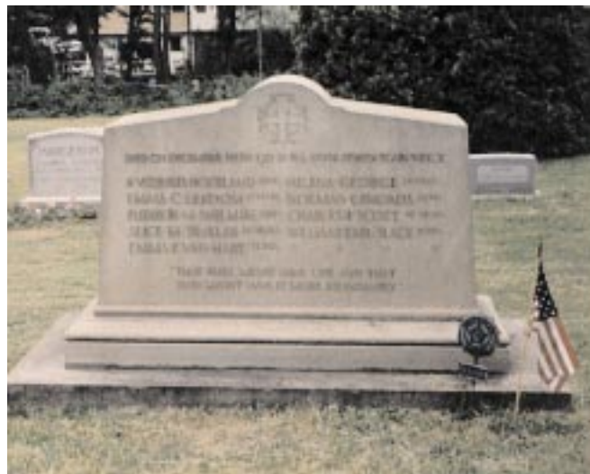
Common grave identifying nine victims of the tragic Bryn Athyn train wreck on December 5, 1921