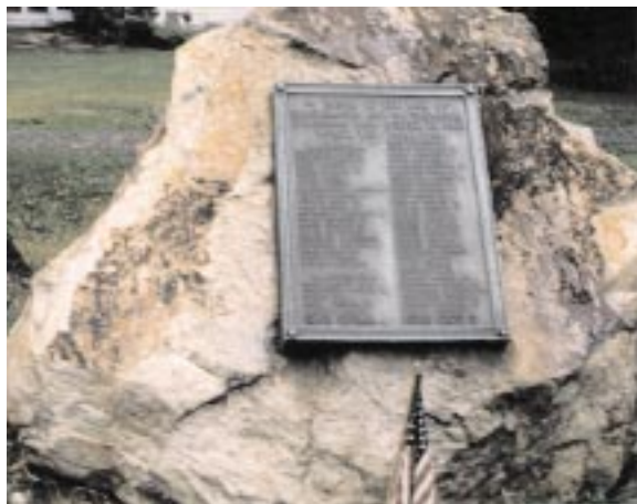
Churchville Monument to those that served in World War I, 1914-1918