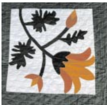
A square from a Pennsylvania Tulip quilt