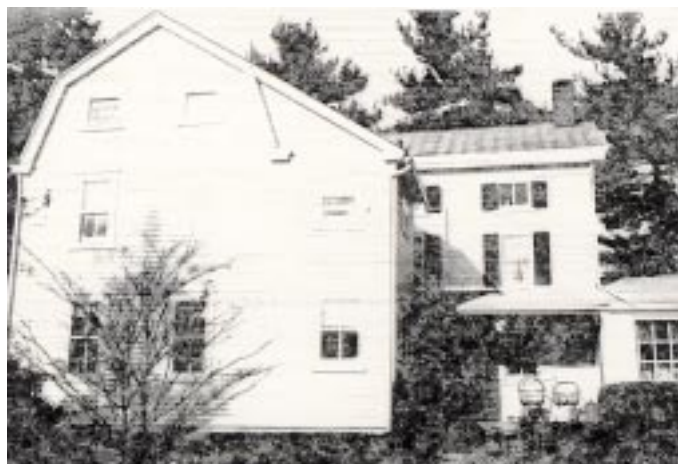
The Scott home in Churchville