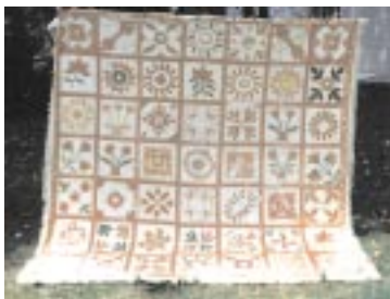
Delaware Valley quilt. Signed and dated, 1840's